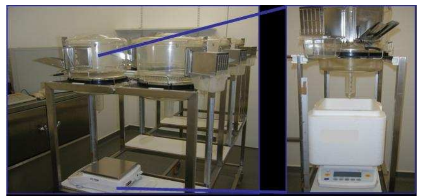
Figure 1: Metabolic cage with weighing device for spontaneous micturition evaluation

Metabolic cages coupled to a weighing device (figure 1) allow the repeated monitoring of diuresis and renal function, as well as the evaluation of spontaneous micturition in conscious rat / mice. Moreover, the urinary excretion rate of a wide variety of substances can be biochemically determined in 24hurine samples collected on ice, limiting thus the possible degradation of the excreted substance.